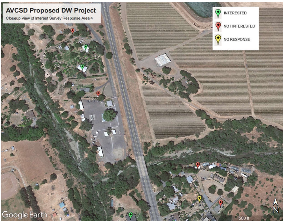
Figure 6. Close-up map of community interest by area