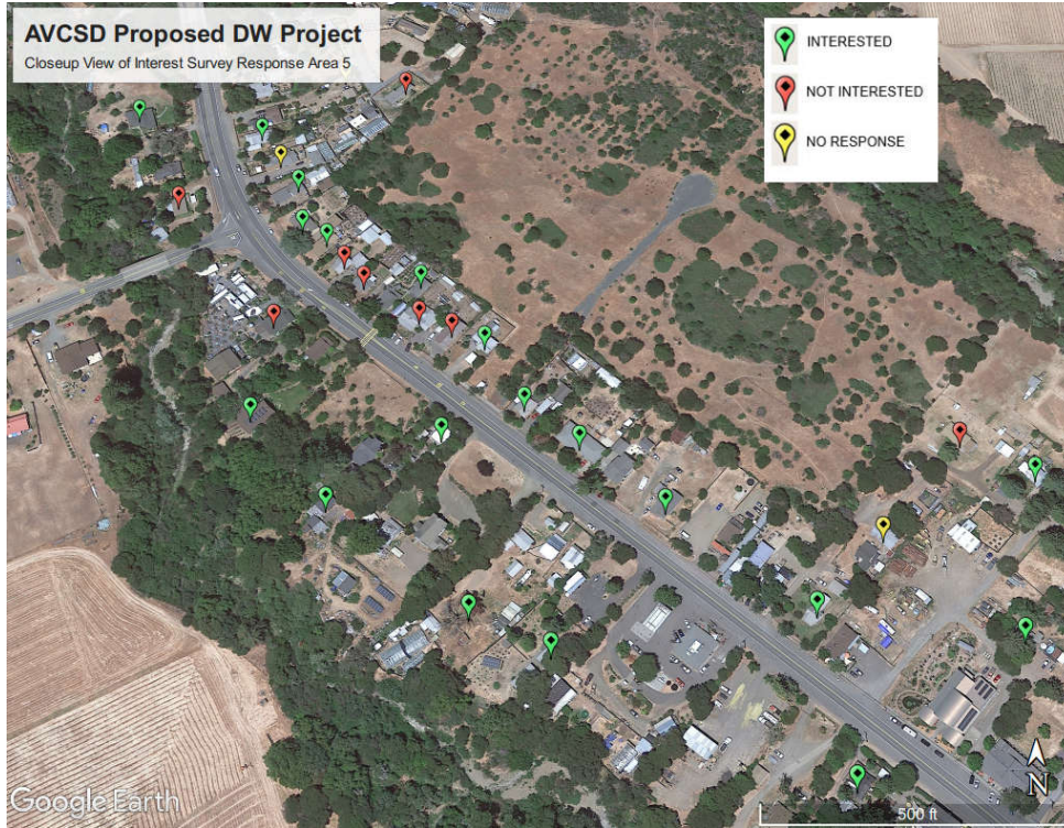
Figure 7. Close-up map of community interest by area