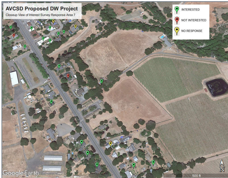
Figure 9. Close-up map of community interest by area