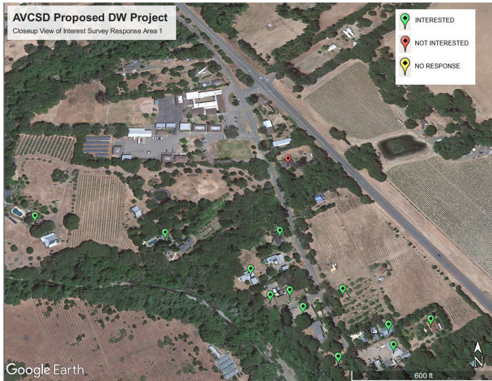
Figure 3. Close-up map of community interest by area