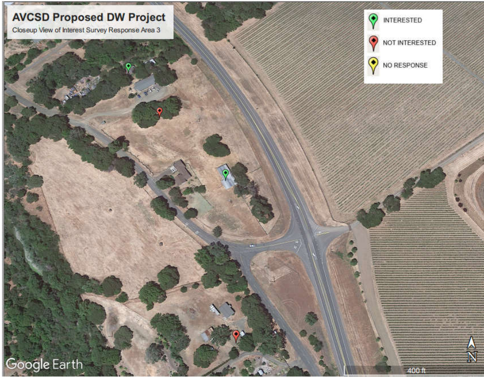
Figure 5. Close-up map of community interest by area