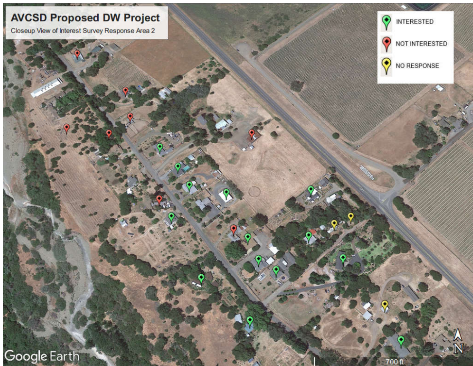
Figure 4. Close-up map of community interest by area