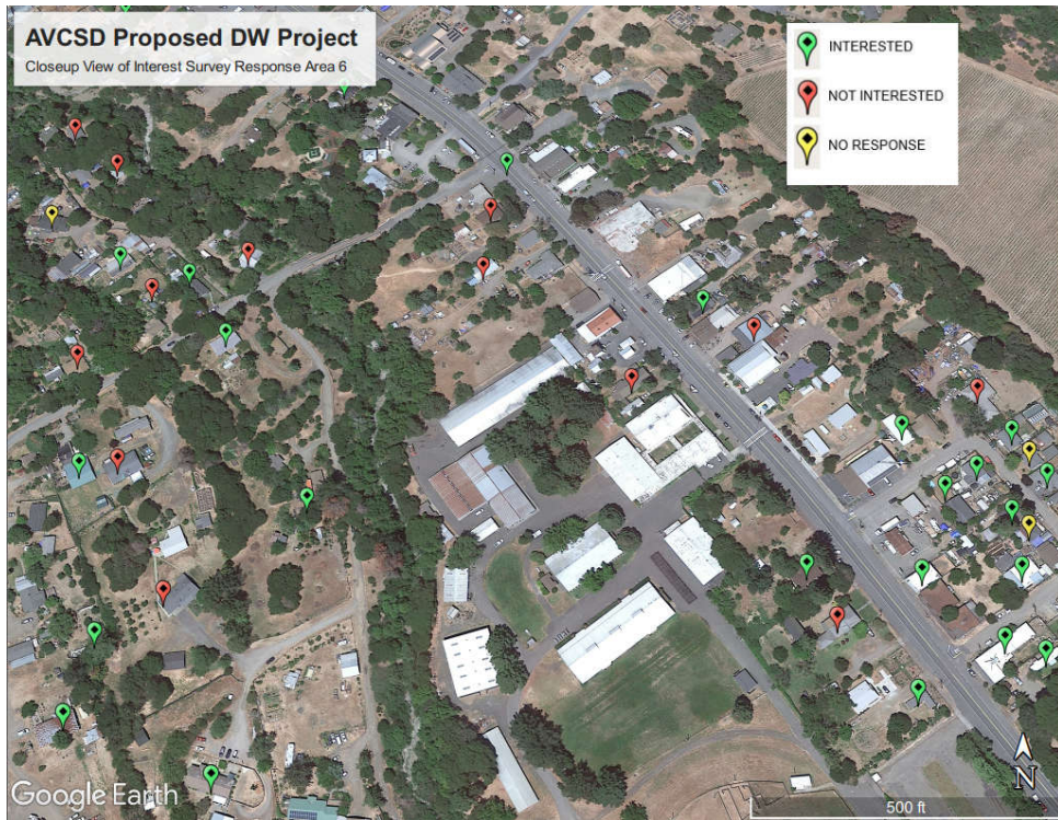
Figure 8. Close-up map of community interest by area