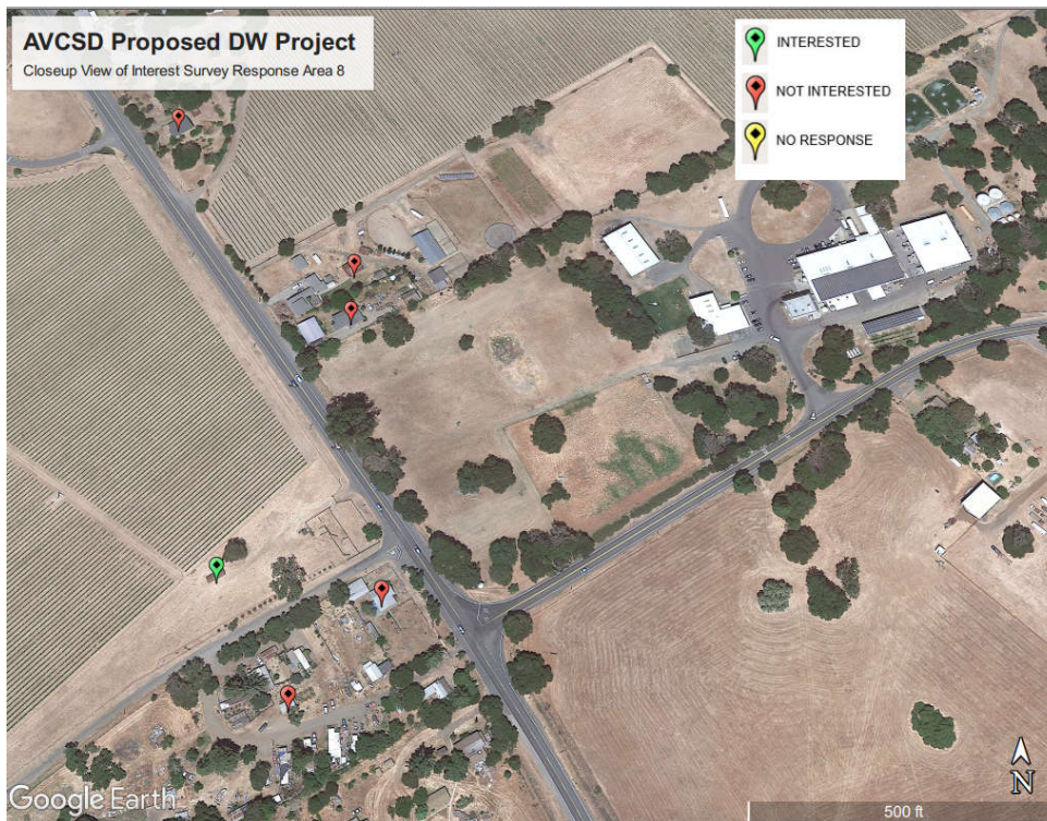
Figure 10. Close-up map of community interest by area