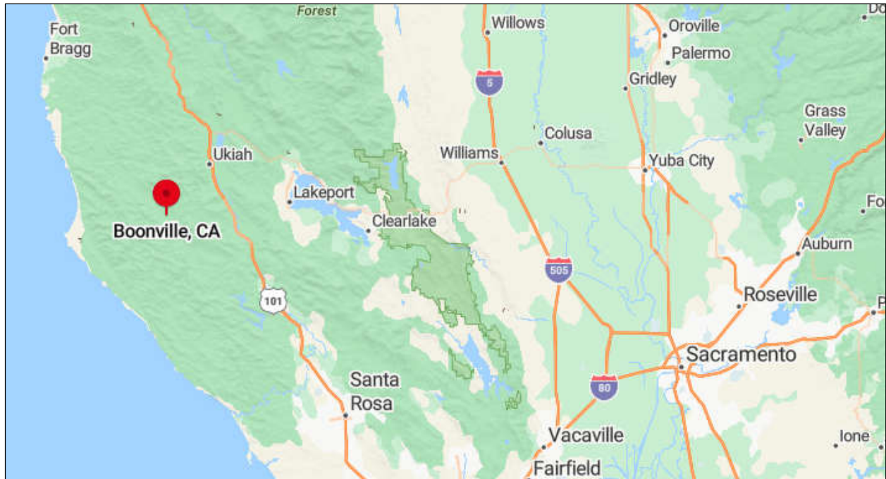
Figure 1: Location Map of Boonville, CA.

Anderson Valley Community Service District (AVCSD) is located in Boonville, a census designated place in Northern California approximately 60 miles northwest of the City of Santa Rosa and 12 miles southwest of the town of Ukiah. The population of Boonville was 1,018 at the 2020 census.